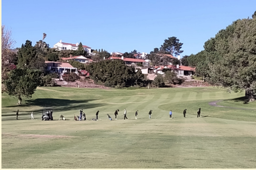
Golf at Mission Club In Lompoc